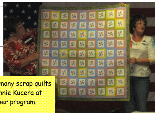
One of the many scrap quilts shown by Bonnie Kucera at the September program.

Monday, September 20, 2010 Blue Valley Quilters Guild Meeting Seward Civic Center 6 th & Bradford, Seward, NE